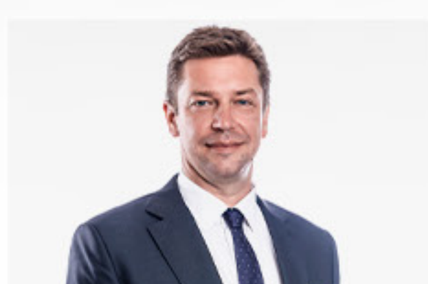
Andrej Doležal Minister, Ministry of Transport and Construction of the Slovak Republic