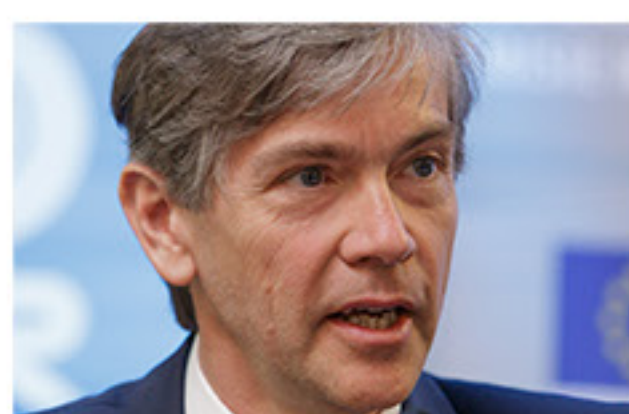
Libor Lochman Ministry of Transport and Construction of the Slovak Republic